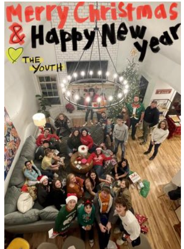
Our youth had a great time at their Christmas party and took this great picture for us!