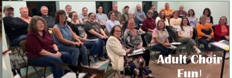
Adult Choir Fun!