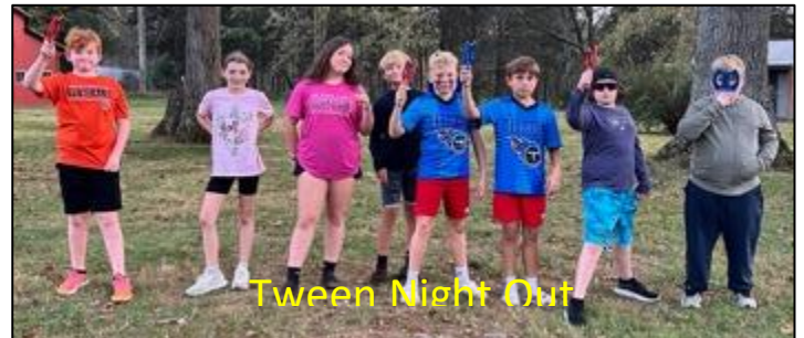
Tween Night Out