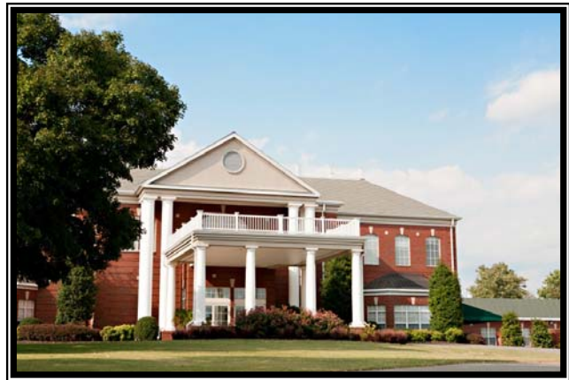
(Stones River Country Club,)

We look forward to you joining us for An Evening to Remember .